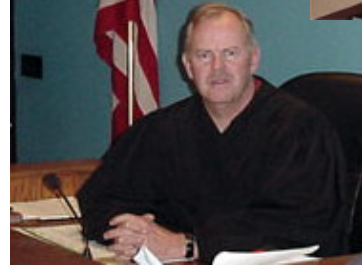
Honorable Nels Swandal in Court

To give a child a CASA VOLUNTEER is to give them a VOICE To give them a VOICE is to give them HOPE To give them HOPE is to give them the WORLD